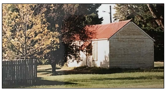
Old Library in situ, early 1980s