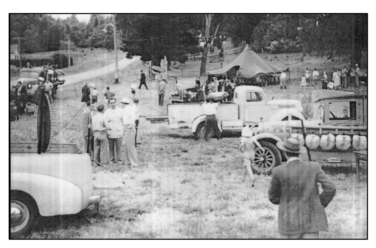
A later Soap Box Derby in Rose St, Bowral, held in 1950

A soap box derby was held annually until 1952, then briefly revived in the 1970s at Bowral and Moss Vale.