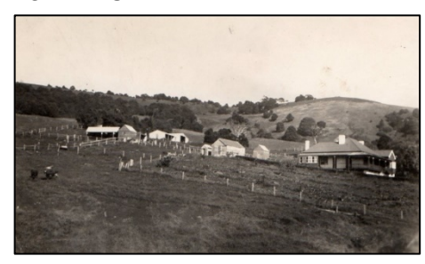
"Pheasant Hill" Kangaloon 1930s.

Unit 1, 1-9 Shirley Street Carlingford NSW 2118