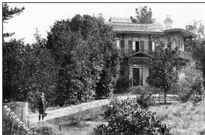
The Arrankamp residence, c1915, after it had become a boarding house.