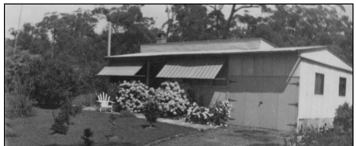
The Murray's enlarged and modernised cottage in 1949.