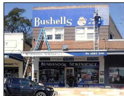
Makeover underway.

Bushells have started a project to restore some of these historic signs around the area and have chosen the Bundanoon sign as one of the first for a makeover.