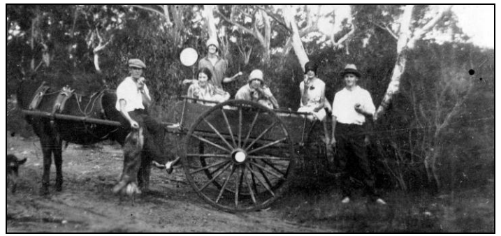
A party at Sheepwash Creek in 1928.