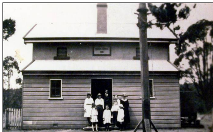
The third Balmoral school, opened in 1893

Once a complete itinerary is finalised, details will be available at the archives for those making a booking and will be provided in the October newsletter. To secure a place on the tour, we suggest you book and pay as soon as possible. Bookings may be made in person, by phone or email to the Archives.