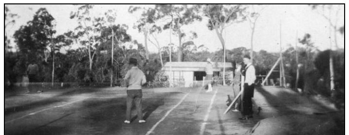
Wilson's Tennis Court Orient St, Willow Vale.