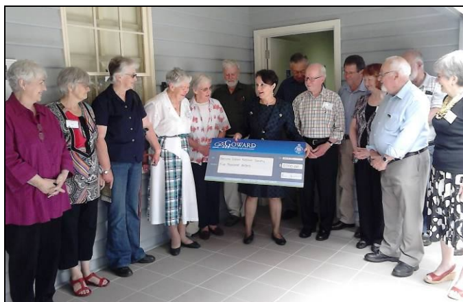
Pru Goward presents grant to members at museum

Recently the Member for Goulburn Ms Pru Goward presented a grant of $5000 to our Society. Provided through the NSW Government Community Building Partnership Program, the grant is for improvement of facilities at the Museum in Berrima as part of the exhibition gallery space expansion. Specifically it helps towards the new disabled toilet amenity.