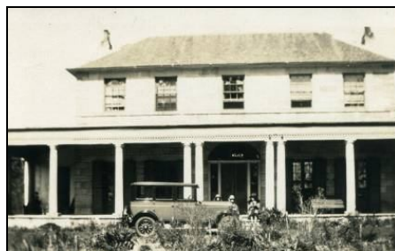
Historic Glenrock in the 1930s