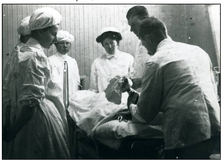
The operating theatre, 1898