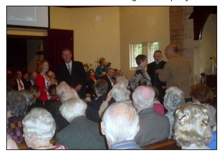
Gathering in St Aidan's church before the service.

The unveiling ceremony was followed by morning tea in the Village Hall, where a photo display depicting scenes of the tragedy was mounted along one wall. Refreshments were provided by members of several Exeter community groups who amply catered for the 200 people. Around tables laden with sandwiches, slices and cakes, those attending reflected on the solemn occasion and relaxed in good company.