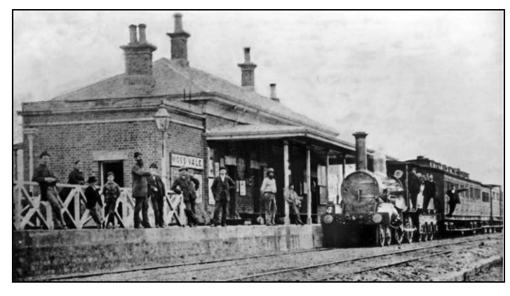
Train at Moss Vale station c1880, a decade before the refreshment rooms were built.

Rail contractors Larkin & Wakeford extended the line southwards and in August 1868 it opened to Marulan.