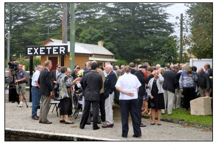
A view of the crowd after unveiling ceremony. (G Morgan)