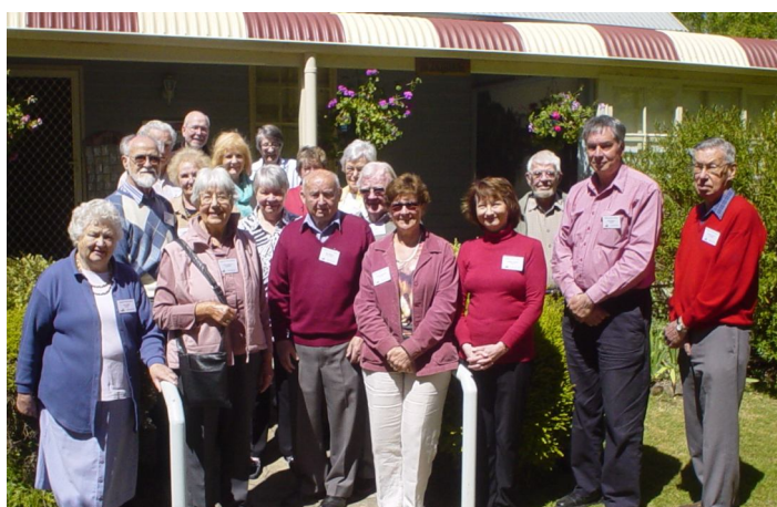
Museum volunteers at the recent annual thank-you morning tea